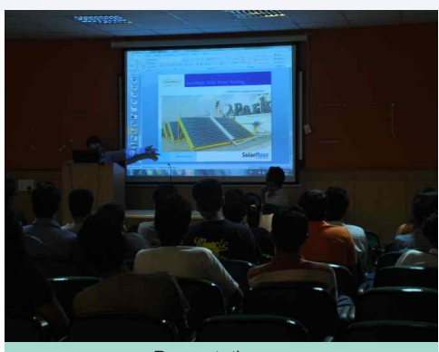
Presentation on 'Solar Water Heating System'