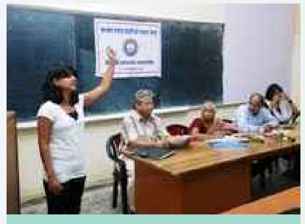
हिंदी सप्ताह में आयोजित काब्यपाठ प्रतियोगिता