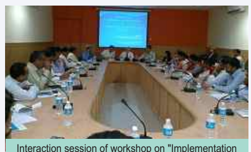
Interaction session of workshop on "Implementation Plan for ECB Directives in Rajasthan'