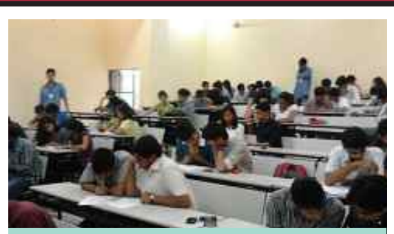
Participants of Sustainable Energy and Environment Quiz